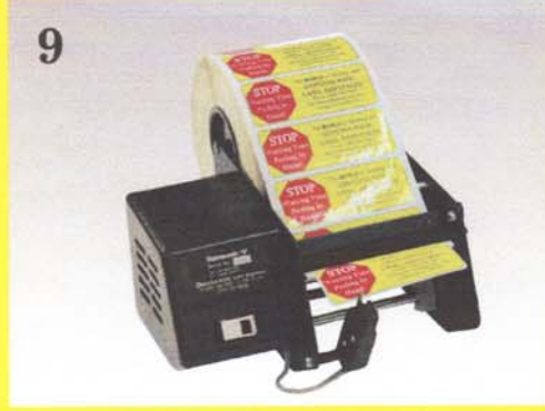
9. Dispensa-Matic "6-II" - for roll or fan-fold labels to 5.5" width. Does not wind up waste, and loads VERY quickly. Better for large diameter rolls, and where constant speed is needed. (6" per second advance.)

Bottle-Matic Is a perfect machine for labeling your cylindrical objects! Our machine will wrap your bottles, cans, tubes, and jars by simply pressing the foot-switch! We can even do tapered objects without customizing! Even if your can or bottle has ridges we can customize the rollers to work with them. Customizing your Bottle-Matic is charged per hour, and if we can't make it work, you pay NOTHING! Simply send your object to be labeled, and a roll of the labels to be applied.