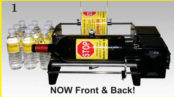
1 NOW Front & Back!

A trouble free low cost way of affixing pressure sensitive labels when compared to the cost of complex high speed labeling equipment and the skilled personnel required to operate them